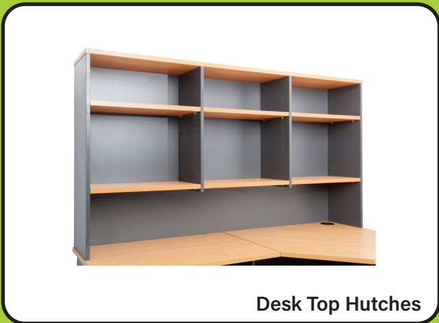
Desk Top Hutches