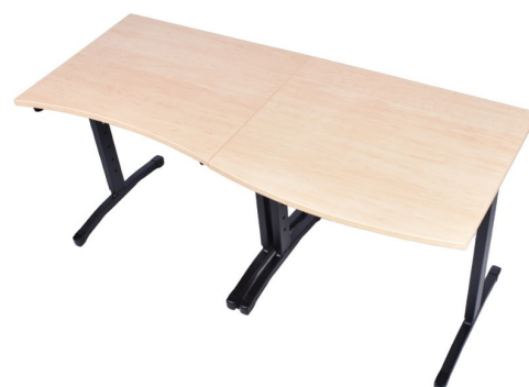
'SASSY' Inner Wave