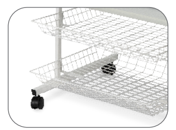
2 Level Big Book Bin