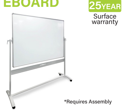
Double Sided Mobile Pivoting Porcelain Whiteboard