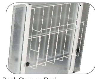
Back Storage Rack